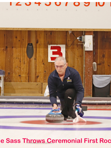
e Sass Throws Ceremonial First Roc